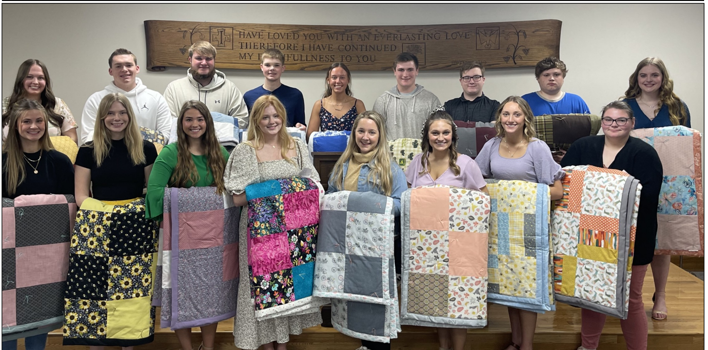
On April 24, Trinity’s high school seniors received their quilts made by the Trinity Piecemakers.